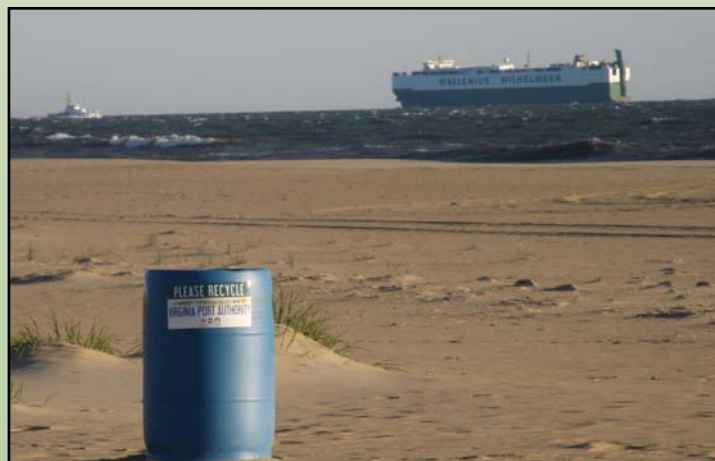
Recycling bins on local beaches encourage citizens to clean up after themselves in an environmentally-friendly manner.

Recycling cans have been placed on Virginia Beach's North End to promote recycling along the resort's beaches. The receptacles are located on the North End of the oceanfront between 68th and 79th streets, where cargo vessels can be seen entering Chesapeake Bay on their way to the marine terminals. The project is a community partnership between the Virginia Port Authority and the City of Virginia Beach Department of Public Works.