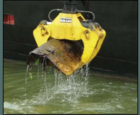
A large piece of debris is removed from the water by a USACE vessel. Much of the driftwood and biodegradable debris collected from local waterways is disposed of at CIDMMA.

USACE survey and navigation support teams also keep local waterways clean during the Chesapeake Bay Foundation's annual Clean the Bay Day. This year, the crew of two vessels picked up floating debris that could potentially damage vessels, as well as 450 pounds of trash. Most of the trash that is collected daily includes aluminum cans, styrofoam containers and cups; and plastic bottles and bags.