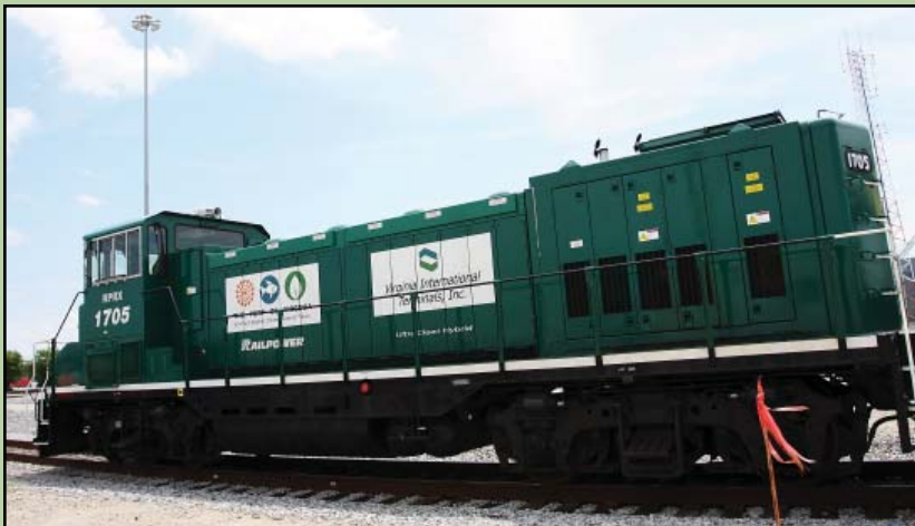
The Green Goat uses half as much fuel on a daily basis as a regular locomotive.